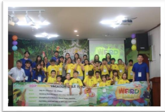
A successful Summer Vacation Bible School took place during the last weekend of July

2017 seems to be a year of transition. With the renovations in full swing at the main campus of Chungdong FMC, all worship services and actions had to relocate to Yewon School. In spite of all the changes, church life goes on. The English Ministry also had to adapt to the changes. A steady flow of visitors are still finding their way to both morning and afternoon services while moving stuff from the offices to worship venues have become part of the “normal” Sunday drill. Here are a few highlights of the summer program and Chuseok activities.