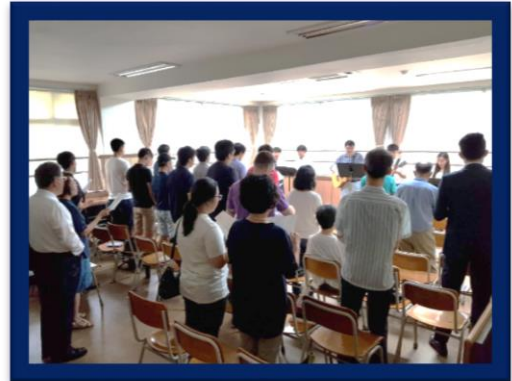
Contemporary Worship at Yewon School