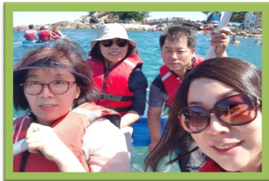
Summer retreat for EM members and friends